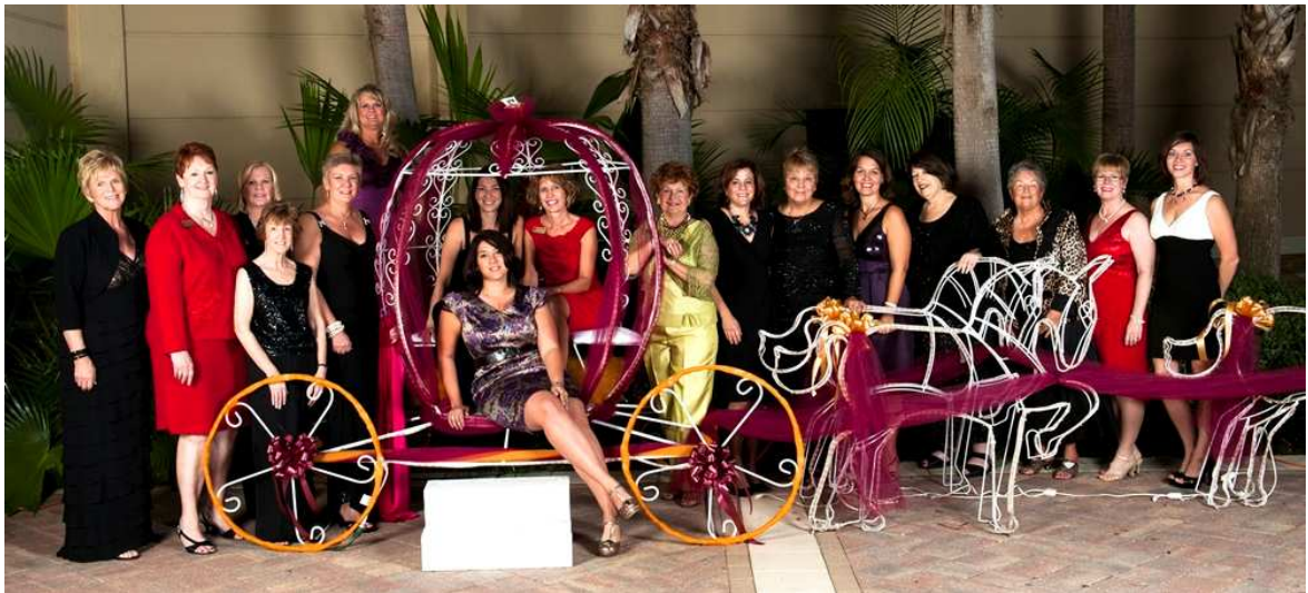
Our Lovely Zonta Sisters!

All The Hard Work by the Ball Committee and Every Member Creates An Incredible Night!