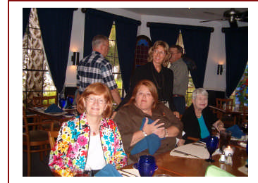
Installation 2006 at the Blue Coyote!