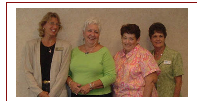
Fruits of our Labor