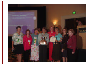
Conference 2006 at Hilton Head