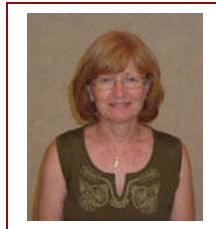
and New Members!